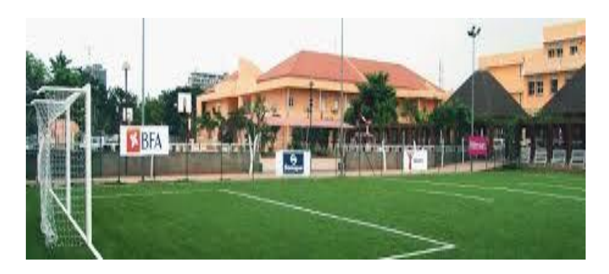
Portuguese School of Luanda. The best school in Angola with Portuguese capitals

A small sample of the quality of education in Angola, considered and the second worst Country in Education in África