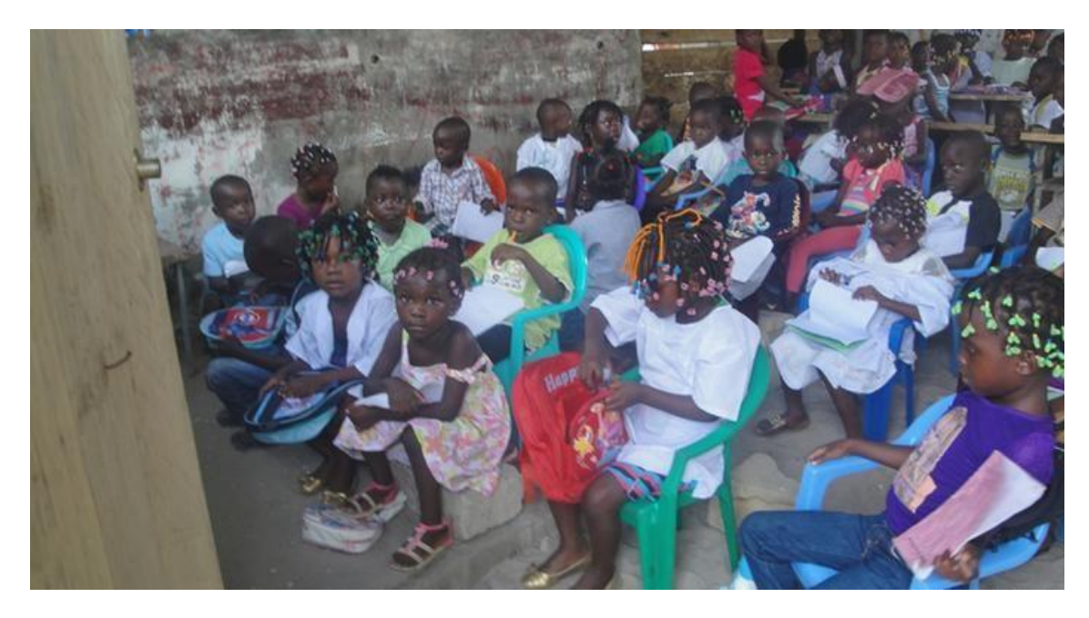
Angolan School of Luanda. The school in Angolan with Angolan capitals