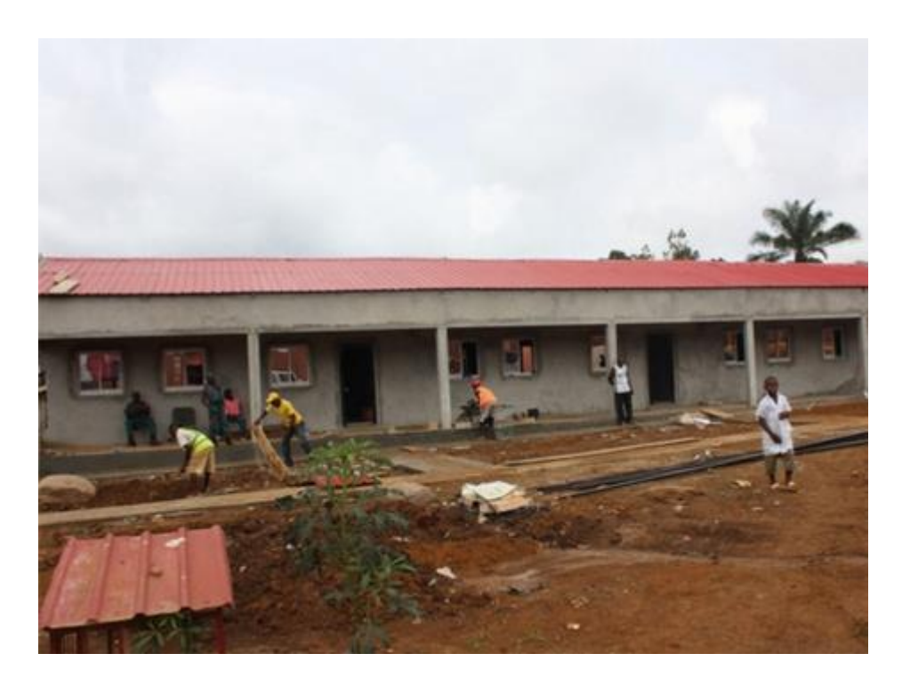
Angolan School of Luanda. The school in Angolan with Angolan capitals