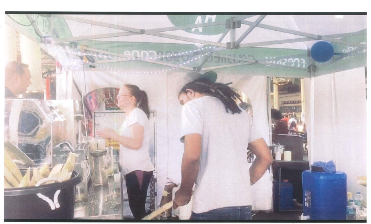
While Austratian and Sido. Rustralian serving sugarcare juice