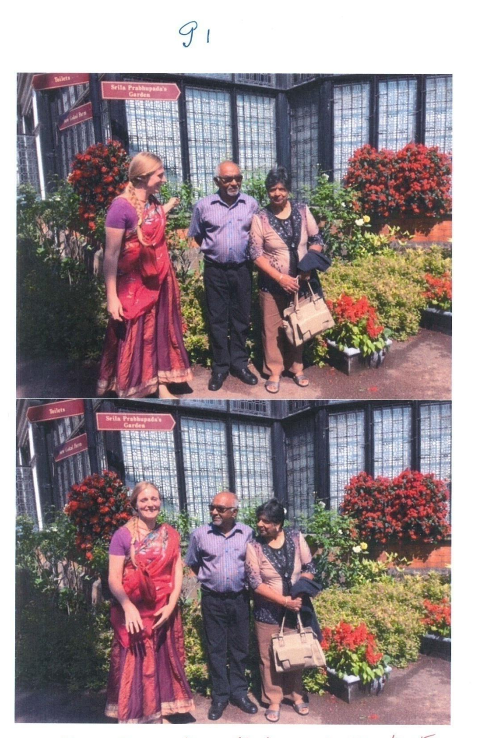
Hare Rama Have Krithma devotes together with visitors from Mauritous as St. Albans.