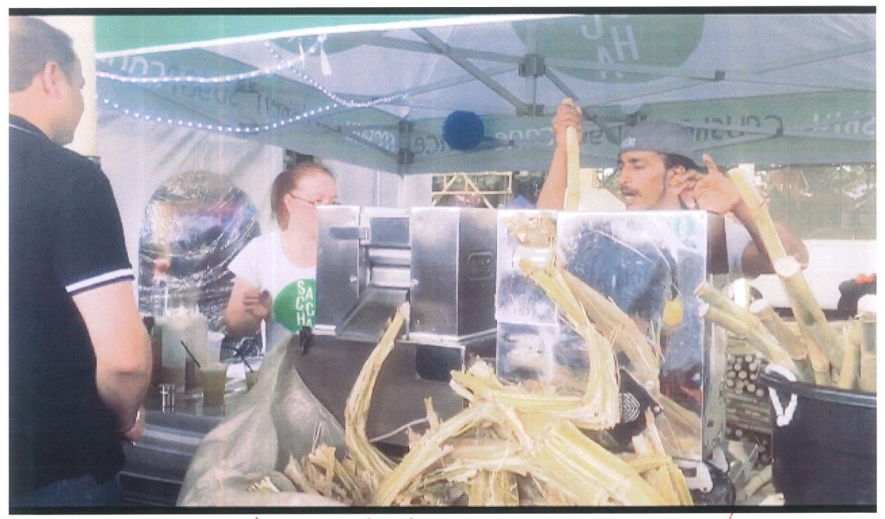
While lady and Inde Aristration making Sugar come Juice Las Visitors.