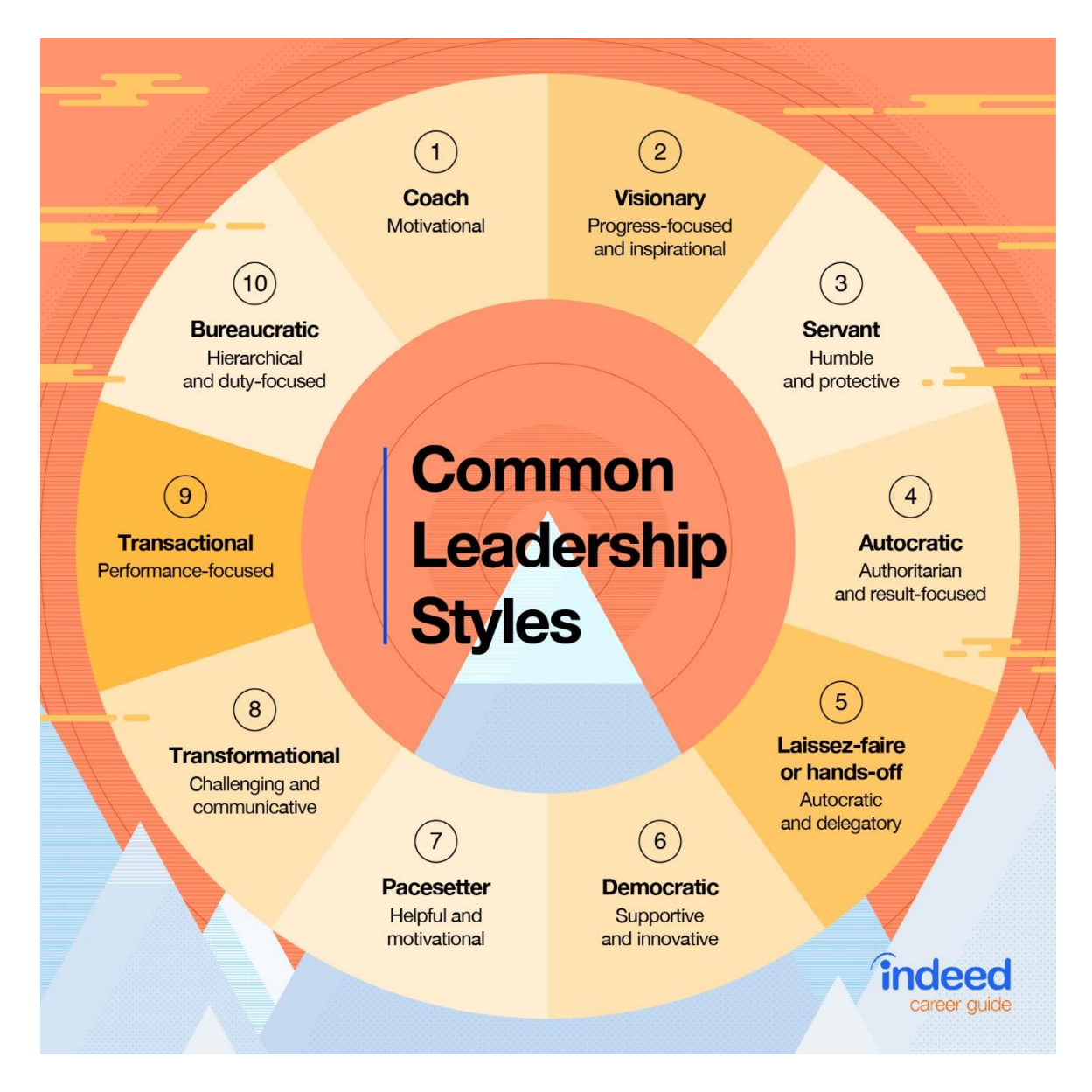
Figure 1 - Common Leadership Styles

According to Gallup (2021), only 20% of employees are engaged in the workplace. Managers can use different methods to increase employee engagement, for example by putting in place efficient practices. They can also improve communication, provide feedback, give recognition, encourage interaction, focus on employee wellbeing, and emphasise employee culture.