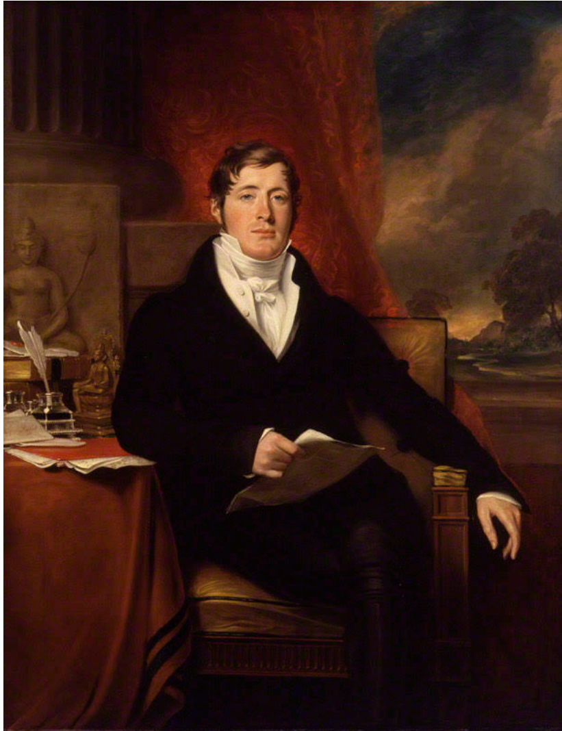
Figure 4: Sir Stamford Raffles' arrival in 1819 marked the turning point in Singapore's history and the arrival of the Christian faith