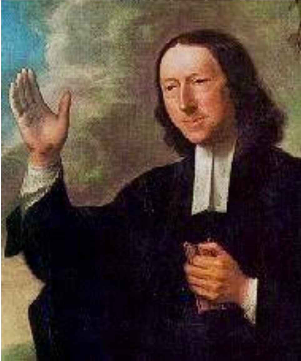
Figure 1: John Wesley, Father of Methodism