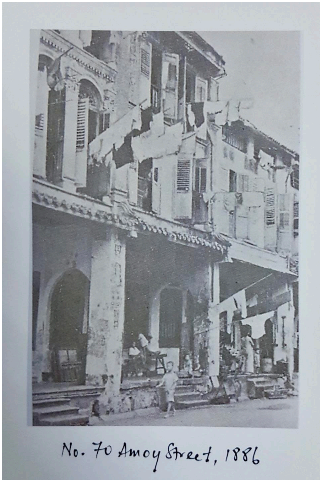
Figure 3: In 1886, the first Methodist school, Anglo-Chinese School, was started by Bishop William Fitzjames Oldham in Singapore, with 13 students